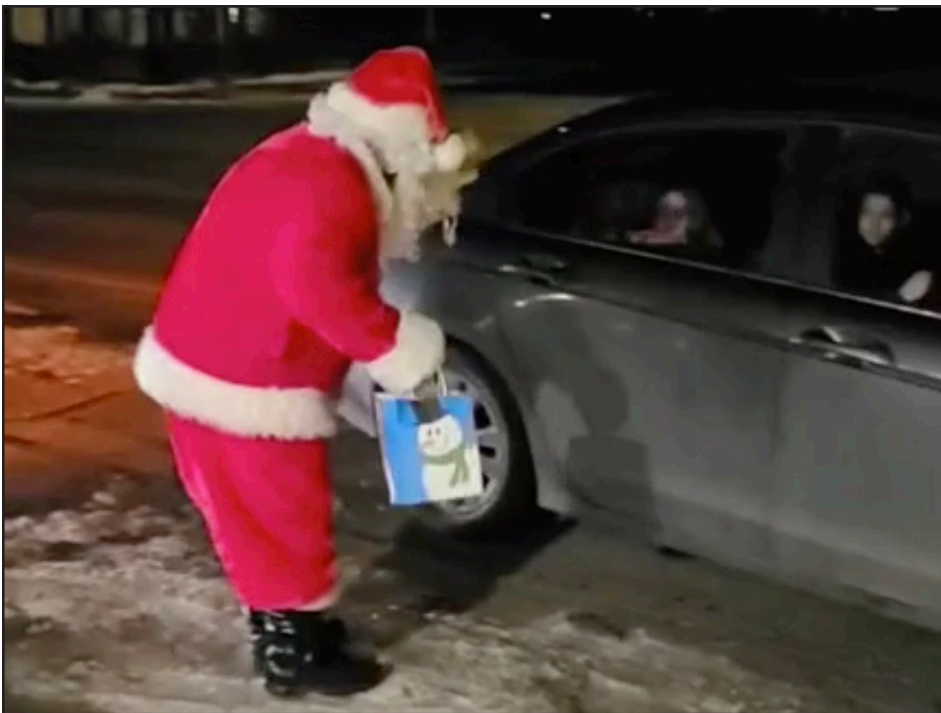
Santa came to town on December 19th, 2020 to give out gifts to our local kids, drive-up style, in front of the Town Hall. Thank you Santa!

Although it has been a difficult year for us all, what we have all learned is resilience in 2020. Taking care of each other is what creates a great community, thanks to all of you!