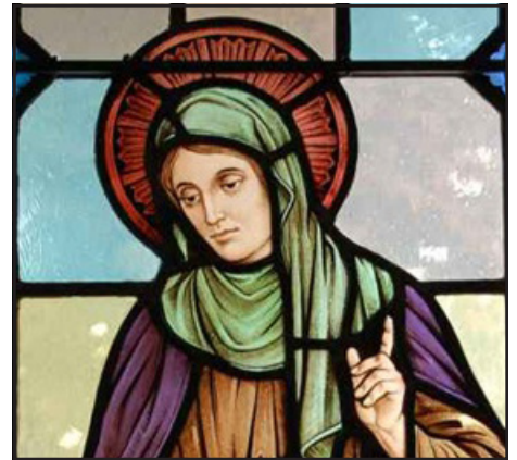
Saint Anne, patron saint of San Luis.

The celebration will begin on Friday with vendors setting up their booths and folks trickling into town. The traditional parade will be held on Saturday and Sunday morning, so start planning your floats now! We hope everyone will consider being involved in the parade this year to show off your