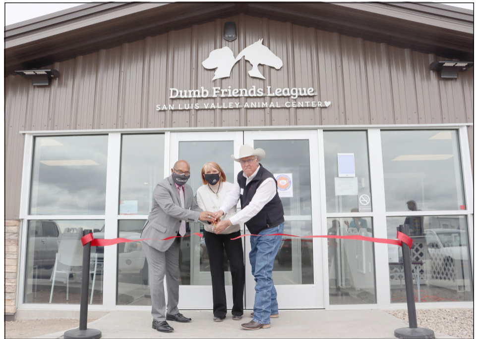
Ribbon cutting ceremony at the new 701 Airport Rd., Alamosa, animal shelter.

On March 25th, the City of Alamosa celebrated with the Dumb Friends League as they opened their regional animal shelter to the San Luis Valley! This $2.5 million investment in a state-of-the-art animal shelter is something never dreamed possible for our low resource area. Homeless and abandoned pets are an unfortunate reality in many communities, including here in the San Luis Valley. Last year there were more than 1,700 cats and dogs that ended up in animal shelters from the SLV area.