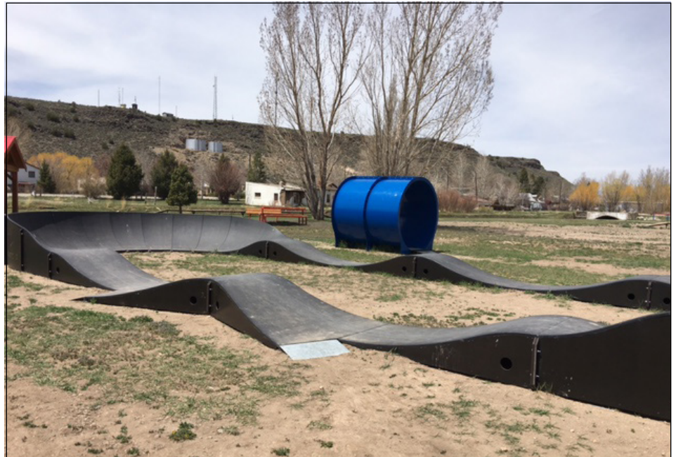
Newly installed skateboard and bike pump track in the San Luis Community Park.

STAY INFORMED! Register for email updates from the Town of San Luis • www.townofsanluisco.org