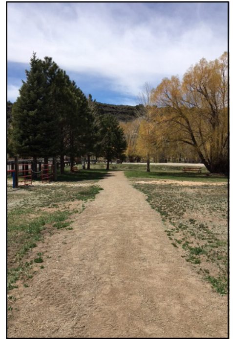
Quarter-mile park walking path.

Also available is a newly installed ramp, obstacle features and pump track to develop biking skills for bikers of all ages. There is also a bike playground for young riders as well. Come give it a try!