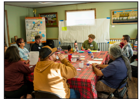
The recreation committee has been meeting monthly to discuss events and site planning.

ation, discussing past amenities such as the old gym, the swimming pool, horse races, and dances. Enthusiasm spread throughout the group as they discussed roller skating in the gym, dances in the SPM-DTU, and swimming in the outdoor pool.